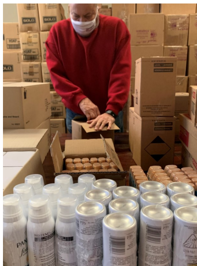
Preparing hygiene supplies for distribution