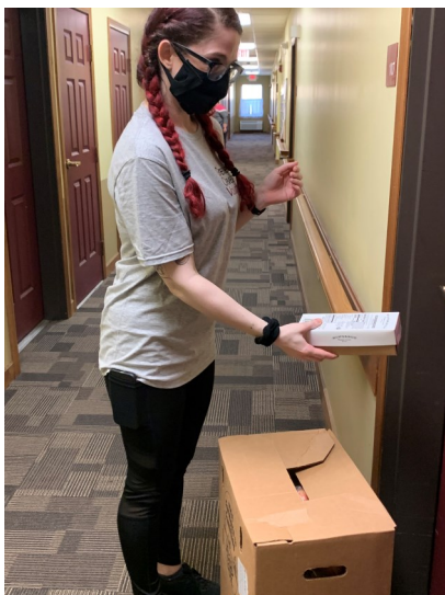
Delivering food box at an older adult apartment complex