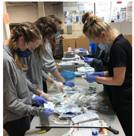
Sorting medical supplies