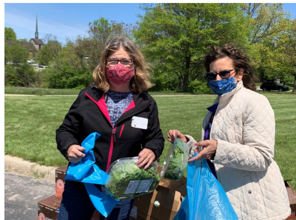
Food distribution at a Cuyahoga County Public Library branch