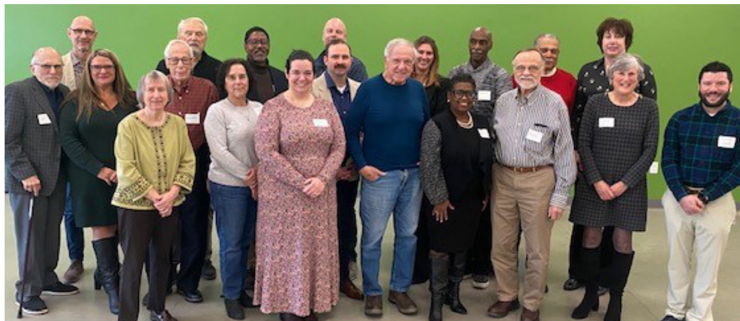
2023 Greater Cleveland Volunteers Board of Directors